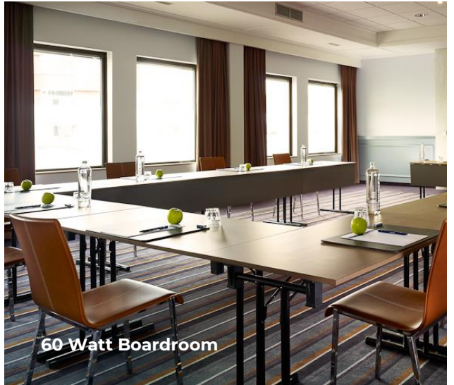
60 Watt Boardroom