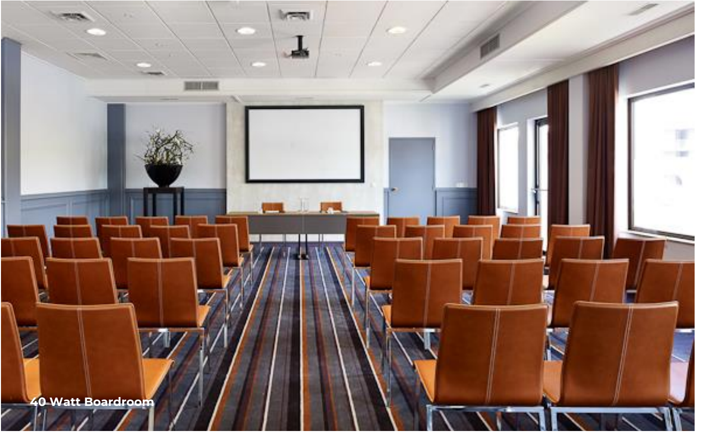
40 Watt Boardroom