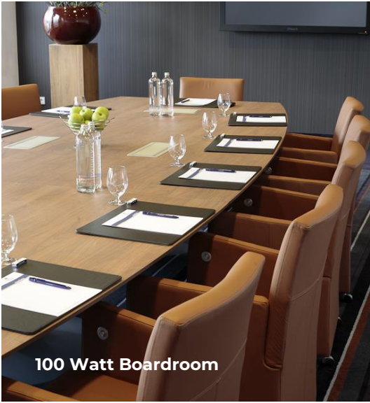
100 Watt Boardroom